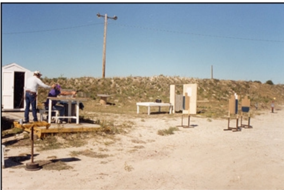
Photo taken at another of the Cowboy Matches. This time it shows the platform with shooting bench. The large dirt berm to the west is the separation between the 50 yd. and 100 yd. ranges.

A small shed was used to hold equipment. Large concrete platform was put in place to use as a firing line.