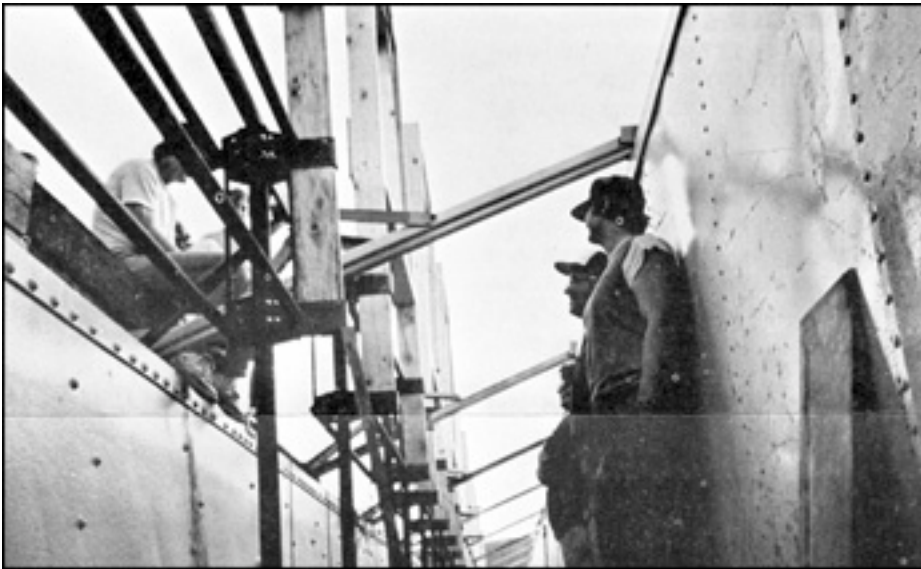
Looking from the east to the west—the 2 x 6 frames have just been installed.